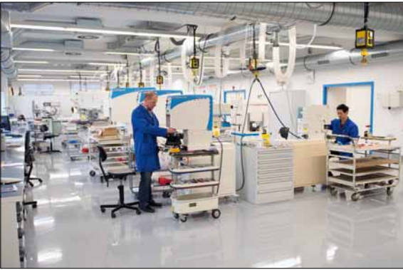
Image: Department Application engineering

Fax: +49 7150 928-400 E-Mail: application@tampoprint.de