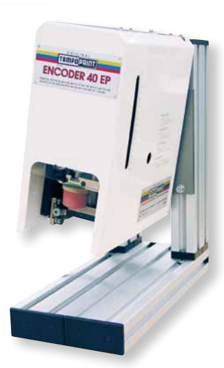
ENCODER 40 EP electropneumatic