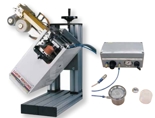
ENCODER 40 EP/1 electropneumatic